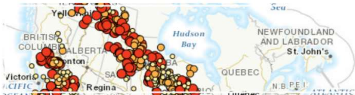
(Forest fires as of August 31, 2017)

Forest fires continue to be a serious challenge across the country , from Ontario to BC and up in the Territories. At the same time, other parts of the country are experiencing flooding , and of course we can't forget our American neighbours to the south, battling the impact of Hurricane Harvey.